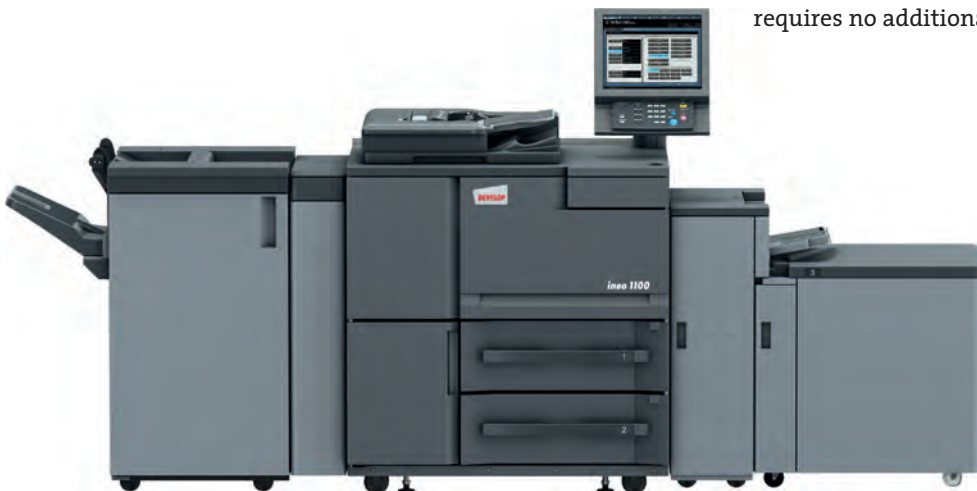
ineo 1100 with 100-sheet finisher FS-532, z-fold unit ZU-6o8, multi-bypass tray MB-5o7 and large capacity tray LU-412

Two ineo 1100 machines can be coupled in a network to tandem-print at 200 ppm – just the speed you need to deal with high-volume jobs, e.g. when presentation material has to be printed on demand. This is a standard feature of the ineo 1100 and requires no additional (and expensive) software.