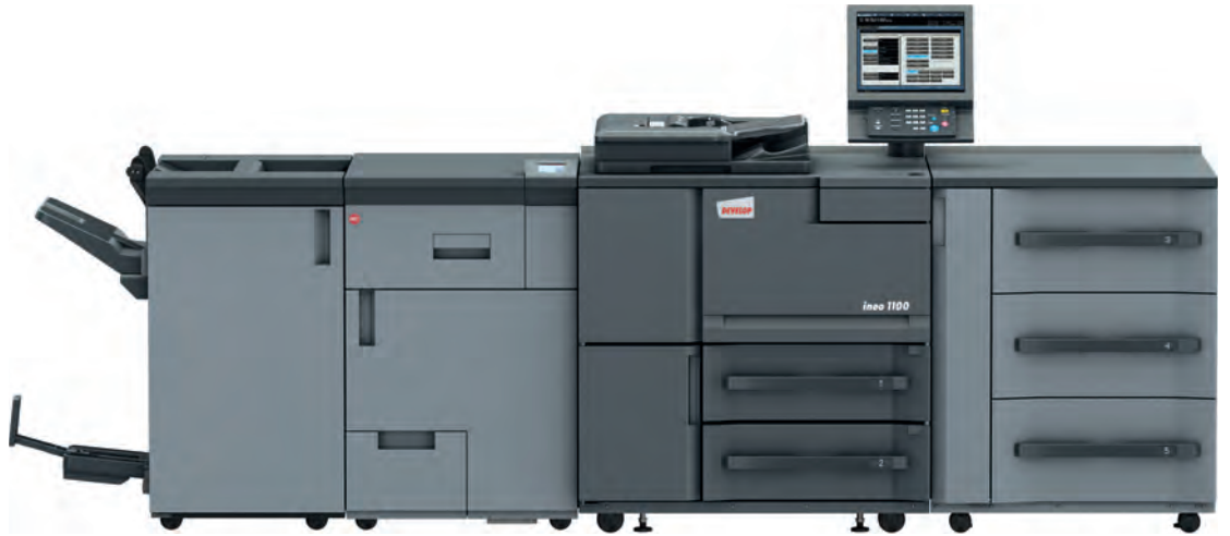
ineo 1100 with auto ring binder GP-502, 100 sheet-finisher FS-532, saddle stitch unit SD-510 and paper feed unit PF-709