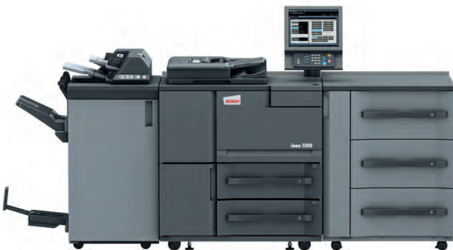
ineo 1100 with 100-sheet finisher FS-532, post inserter PI-502 and the paper feed unit PF-709

If you think you've seen everything in digital printing, take a good look at the quality of this machine's printing. We believe it is unique. Such eye-catching quality is based on a series of innovative technologies, such as precision LED exposure with an impressive resolution of up to 1,200 dpi, sophisticated and ultra-stable media handling, and DEVELOP's unique screening technology. These technical innovations work hand in hand with DEVELOP's own ineo toner to deliver consistently excellent digital quality. And the advantage of digital technology is that you can produce even small print runs at a profit. This is especially true of the ineo 1100 since it runs economically, scans at high speed, and is easy to operate via a clearly arranged touchscreen. All factors you can build on for business success.